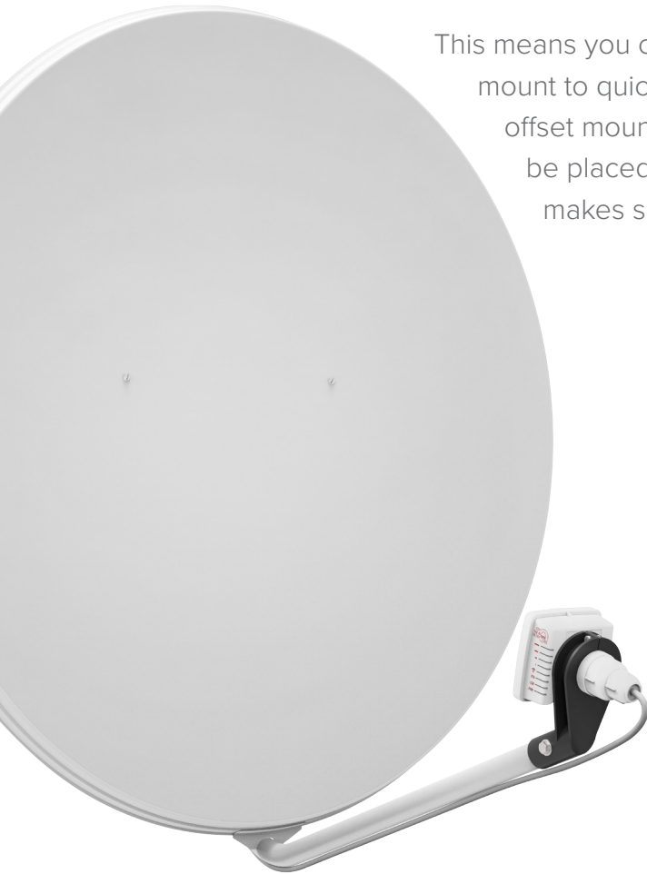
Dish is not included.

This means you can use any available satellite TV dish with an offset mount to quickly deploy powerful long range wireless links. The offset mount is universal at 40 mm diameter, and the LDF can easily be placed inside it. Since the LDF itself is a tiny little package, it makes shipping and deployment simple and low cost.